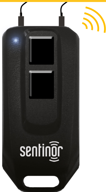
Sentinor Legacy 407-PA Pendant